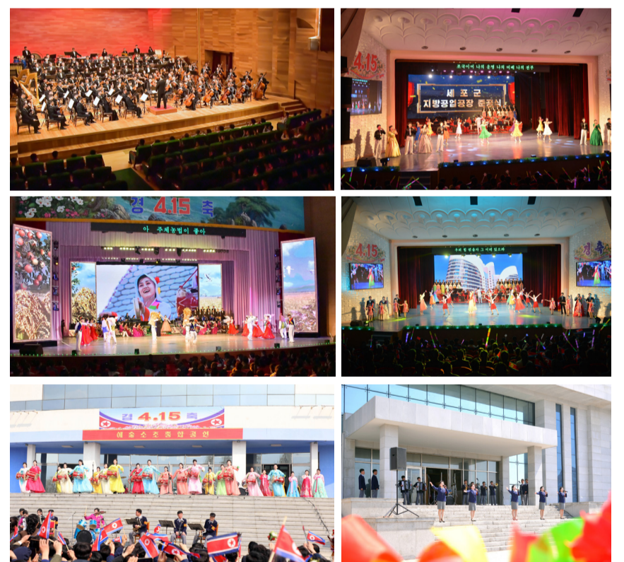
Colourful art performances are given in Pyongyang and the provinces.