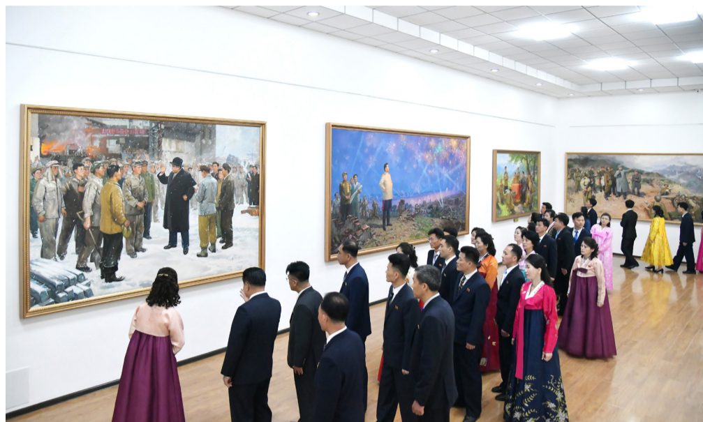
Visitors look round the exhibition hall at the Korea National Art Museum.