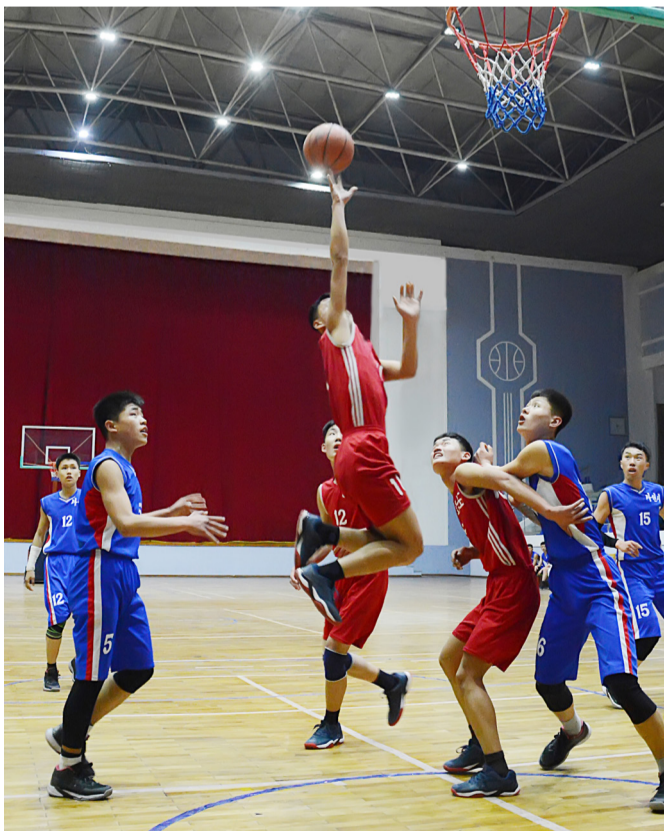
A scene from the basketball game between South Hwanghae provincial and Rason municipal teams.

The North Hwanghae provincial team came first in the Taekwon-Do event which was divided into team pattern, combined power breaking and other categories.