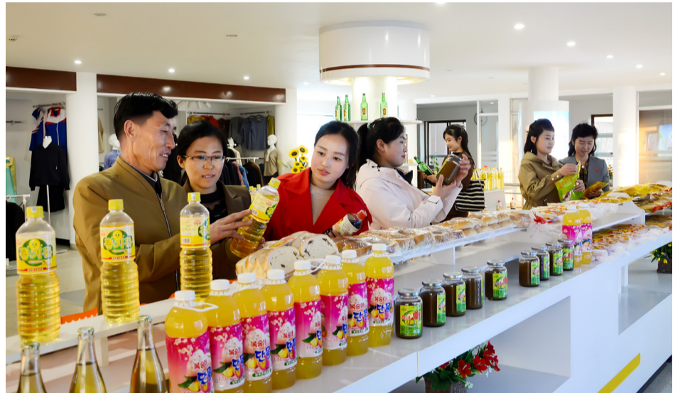
Condiments and confectionery are produced at the Hwangju County Foodstuff Factory to be supplied to residents.