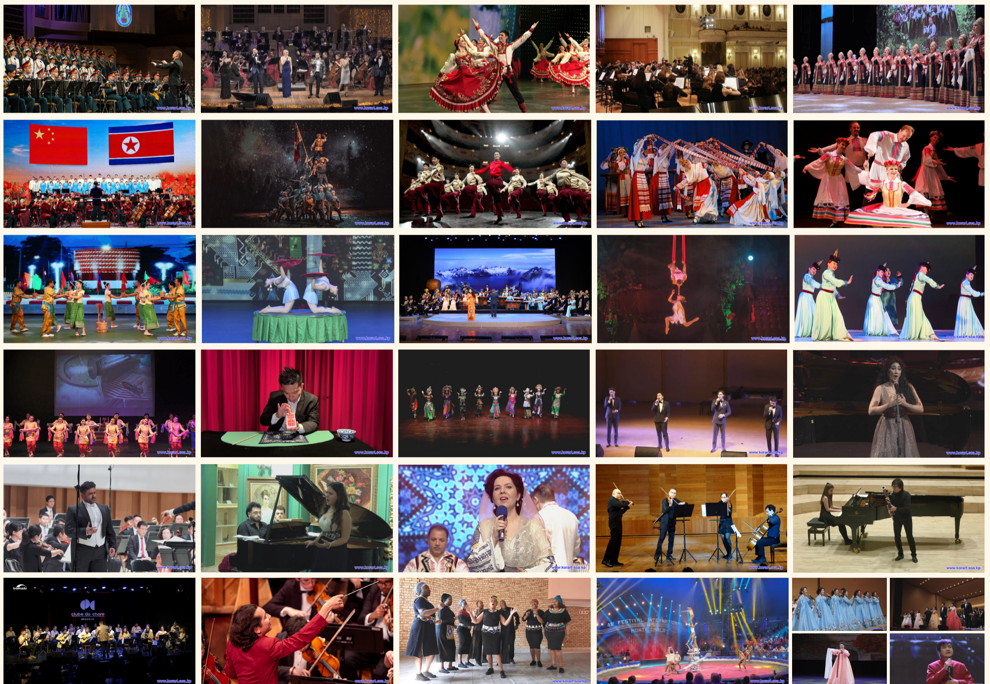
Scenes of performances given by foreign artistes at the 34th April Spring Friendship Art Festival.