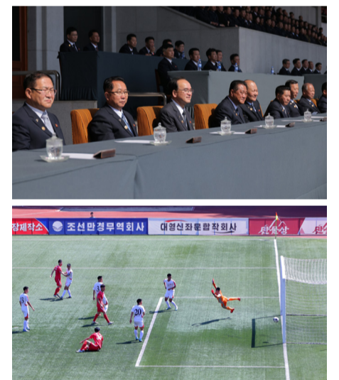
A men's football match takes place between Jangsubong and Wolmido teams at Kim Il Sung Stadium in Pyongyang on April 15.

The spectators exclaimed whenever players displayed