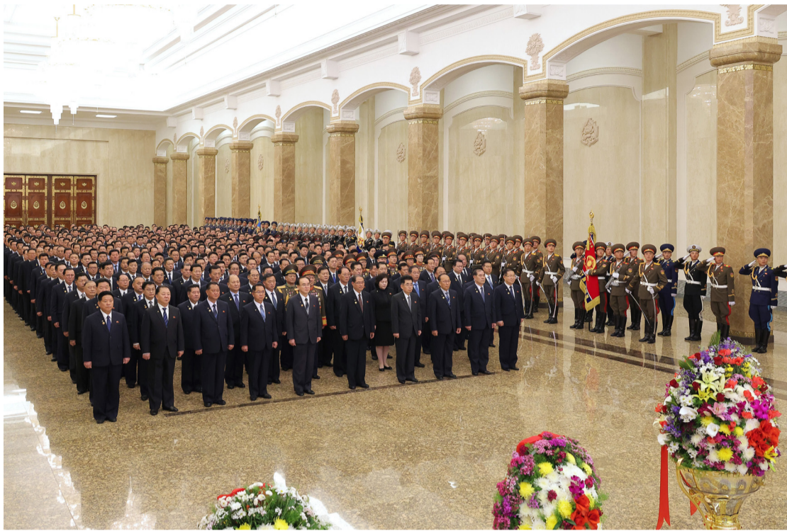
Senior Party and government officials visit the Kumsusan Palace of the Sun on April 15 to pay homage to President Kim Il Sung and Chairman Kim Jong Il on the occasion of the 114th birth anniversary of the President.