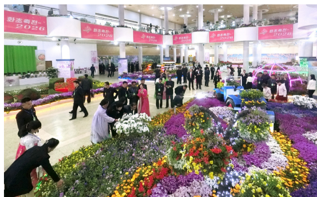
The Flower Festival-2026 opens at the Okryu Exhibition House in Pyongyang on April 13.

At the end of the ceremony the participants went round the festival venue.