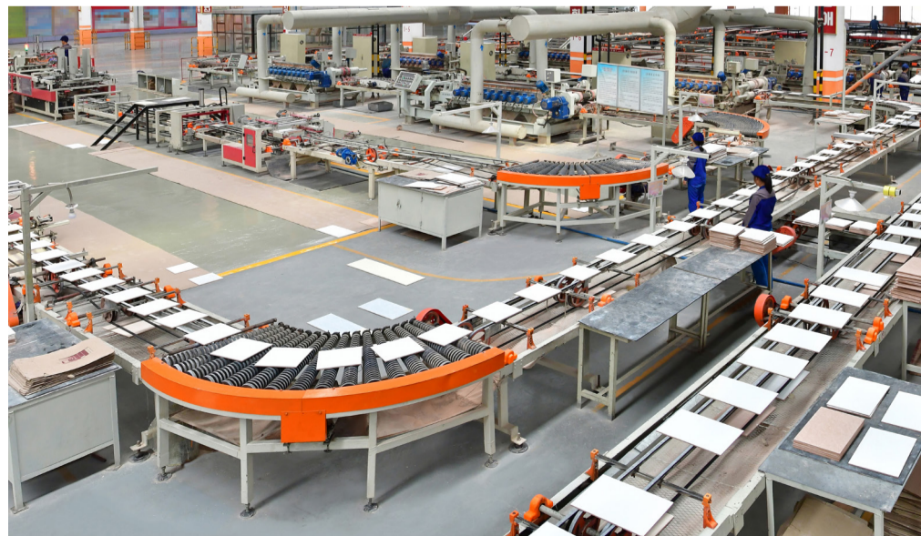
Tiles needed for housing construction are produced at the Chollima Tile Factory.