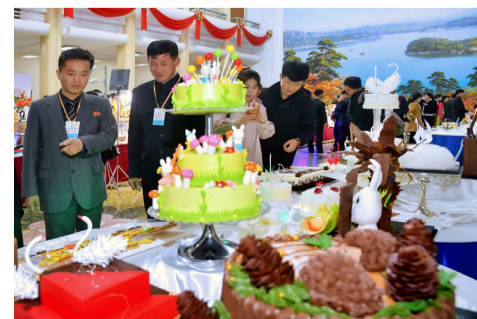
The Sixth Sweet and Biscuit Sculpture Exhibition takes place at the Chongnyu Restaurant in Pyongyang.

The jury announced the results and diplomas, medals and certificates were awarded to the successful units and participants.