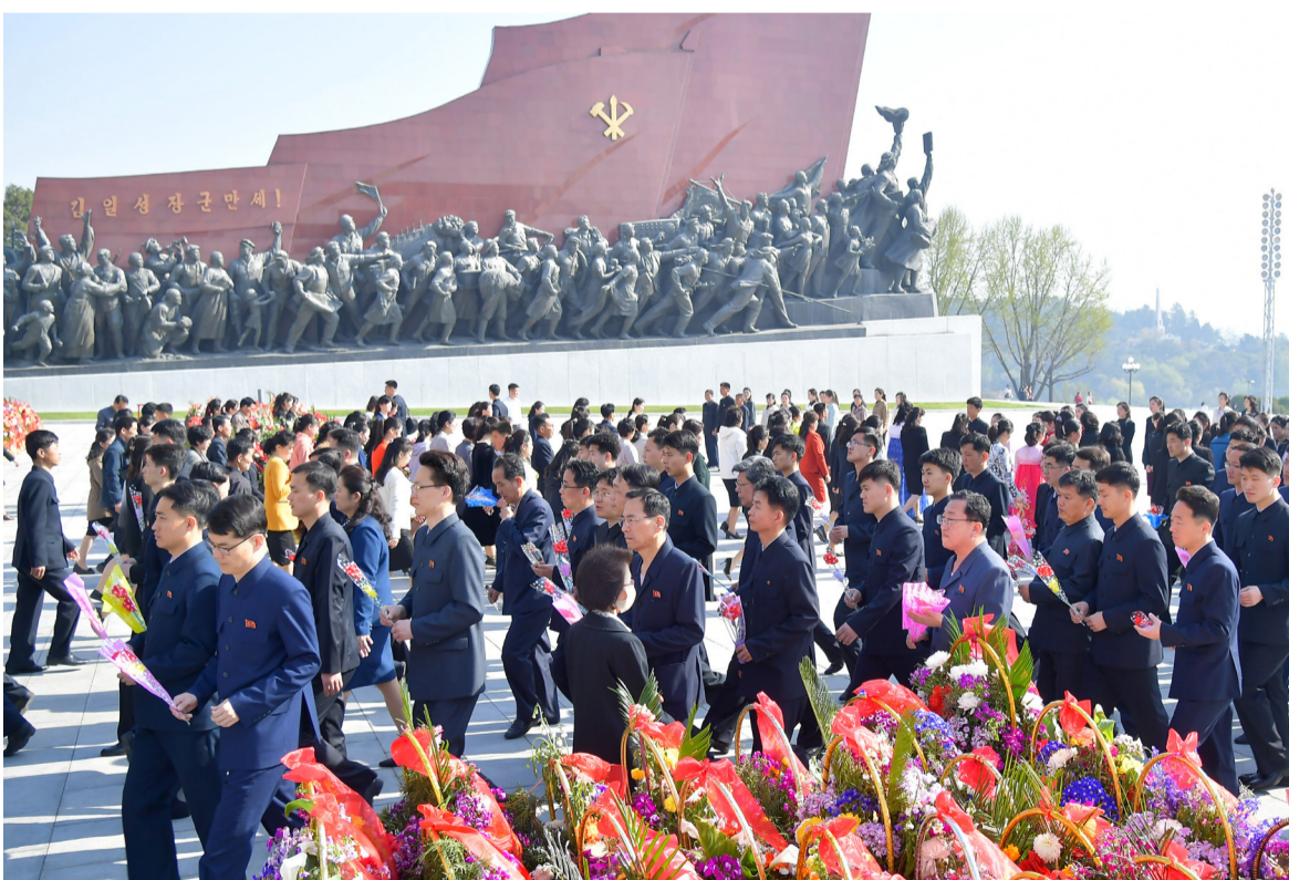
People from all walks of life visit the statues of President Kim Il Sung and Chairman Kim Jong Il on Mansu Hill in Pyongyang.