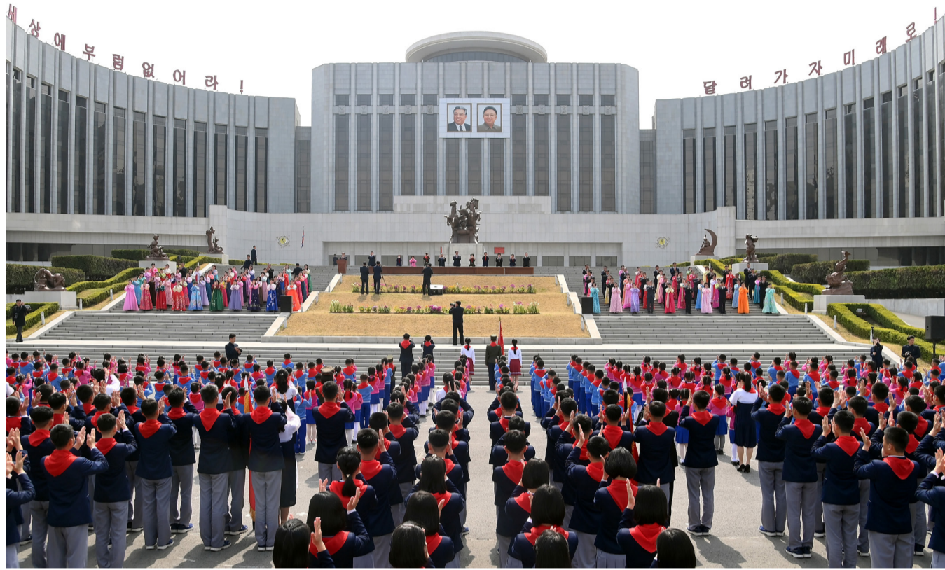
A joint national meeting of the Korean Children's Union organizations takes place before the Mangyongdae Schoolchildren's Palace on April 14.

He referred to the fact that the great Generalissimo Kim Il Sung, who created the proud tradition of the Korean children's movement in the flames of the anti-Japanese struggle, founded the KCU