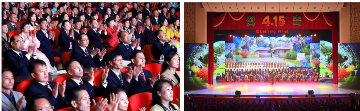
The Mansudae Art Troupe gives a song and dance performance at the East Pyongyang Grand Theatre on April 15.