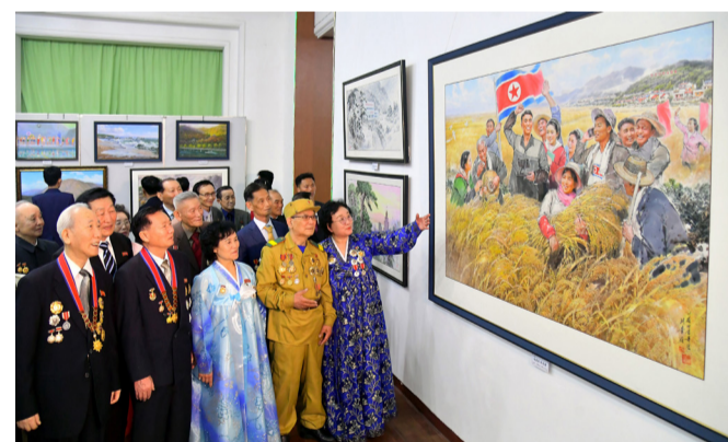
An exhibition of fine art works presented by aged artists opens at the Pyongyang International House of Culture on April 9.

On display at the exhibition hall are dozens of art works, including Korean paintings and oil paintings, created by aged artists in reflection of the Korean people's deep reverence for President Kim Il Sung and the respected Comrade Kim Jong Un.