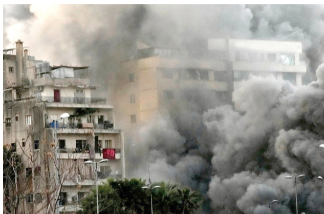
Palestinian women wait for their dear ones killed in a bloody Israeli massacre (far left) and buildings are destroyed in a Lebanese city by Israel's indiscriminate air raid (left).