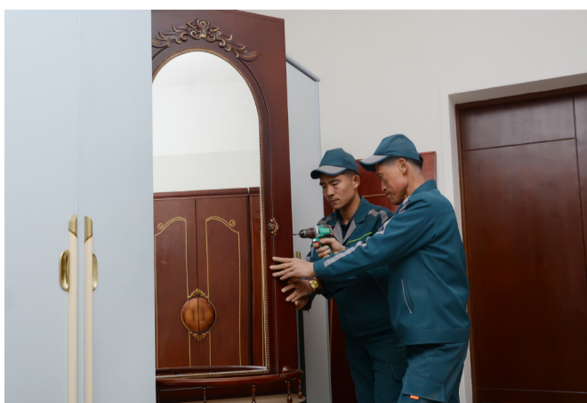
Soaps and furniture are produced at the Hwangju County Daily Necessities Factory.