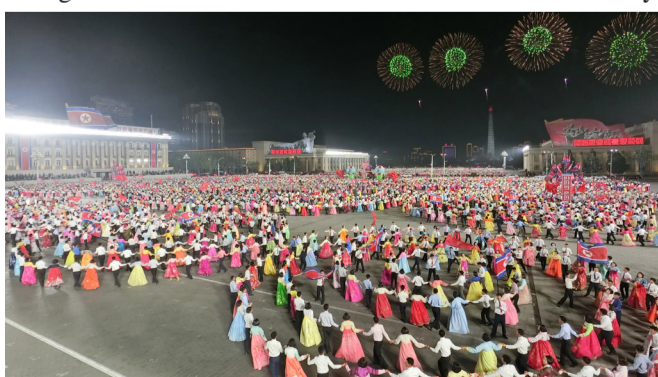
An evening gala of youth and students and a fireworks display take place at Kim Il Sung Square in Pyongyang on April 15.

Party of Korea which is translating the people's dreams and ideals into brilliant reality.