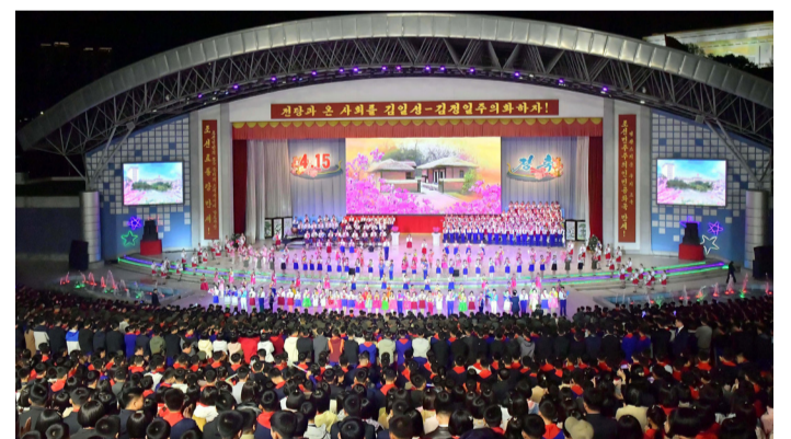
A performance of the art group members of the Pyongyang Students and Children's Palace is given at the Pyongyang Municipal Youth Park Open-air Theatre on April 13.

by firmly carrying forward the traditions of loyalty and patriotism under the uplifted flag of the Korean Children's Union.